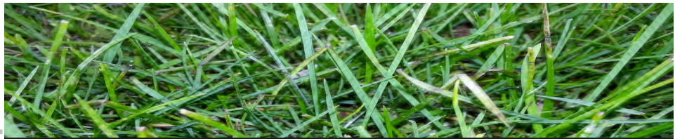
Grass before spring treatment